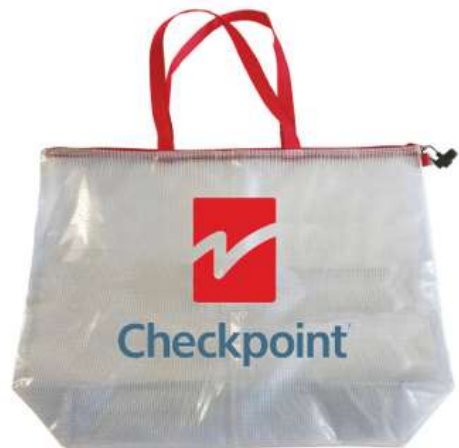
Improved brand awareness at entrance and POS

Standard Lock (9414839, 10111227, 9238054). More info page 80 and 81 of the catalogue.